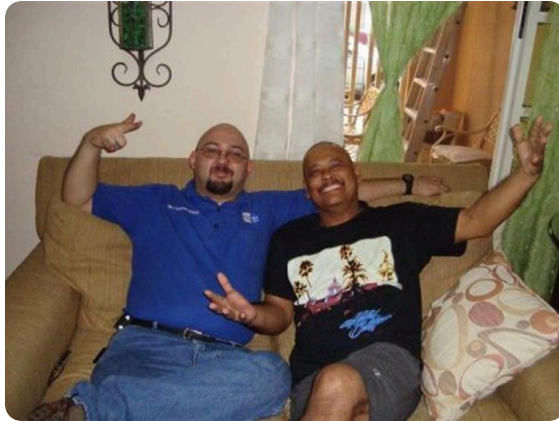
Good Moments! Always happy.